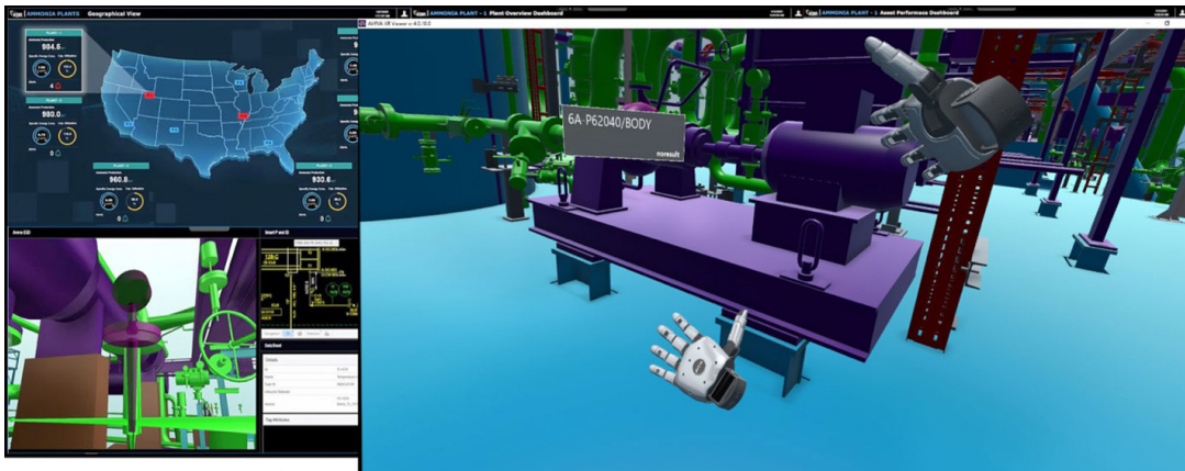
KBR is expanding the visualization layer of its digital twin solution with new, immersive technologies from AVEVA

Tallent said KBR is also planning to begin incorporating more immersive technologies into its digital twin solution. With AVEVA XR, AVEVA's virtual and augmented reality solution, KBR wants to rethink the way we interact with the digital world, extend the visualization layer of its digital twin environment, and make its first foray into the industrial metaverse.