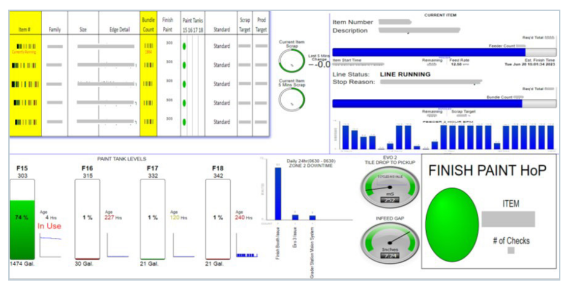
Screens are simple to understand and provide operators the information necessary to make critical decisions on the shop floor.

The architecture of the solution is simple and scalable. Armstrong centralizes disparate information from PLCs, Excel spreadsheets, and other databases into the single AVEVA InTouch HMI interface. The information then comes out in HTML5 web pages. Now, all users need to access key production line data in AVEVA InTouch HMI through a browser connected to the internet. Users can simply open a browser and select the server running AVEVA InTouch HMI using Windowviewer. Custom security settings control permissions, so that a user can either have access to read only or read and write. This configuration allows users to access production data wherever they are, and even make a change on the line without having to be physically present.