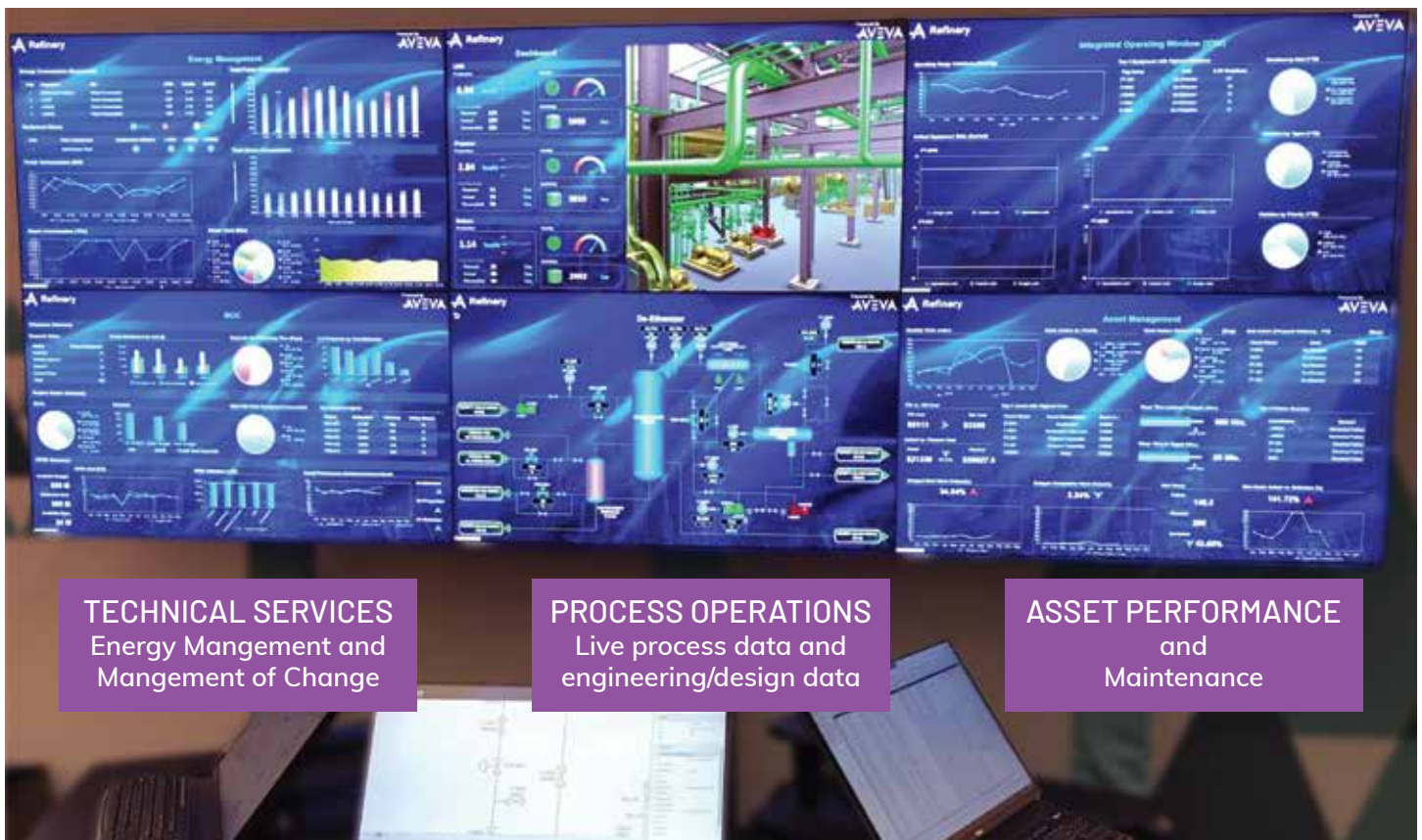
Integrated Collaboration based on Unified Operations Center