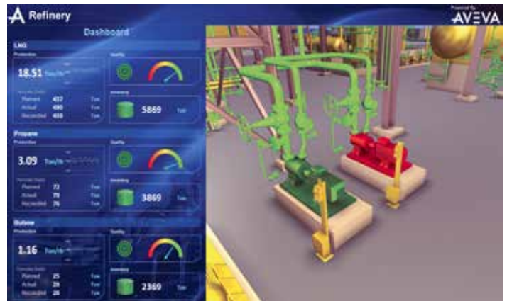
Unified Operations Center turns data into actionable information contextualizing 3D Engineering design with real-time Process data

The solution leverages existing data locked in multiple enterprise and operational systems to enable "fact-based" decisions. AVEVA's Unified operations center is based on a 'system of systems' approach. This enables seamless plug-in of apps, predictive and process analytics, CCTV video, GIS maps, ERP systems, Engineering P&ID diagrams and much more, all within the unified user interface.