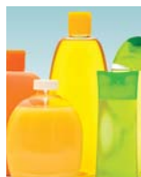
Consumer Packaged Goods