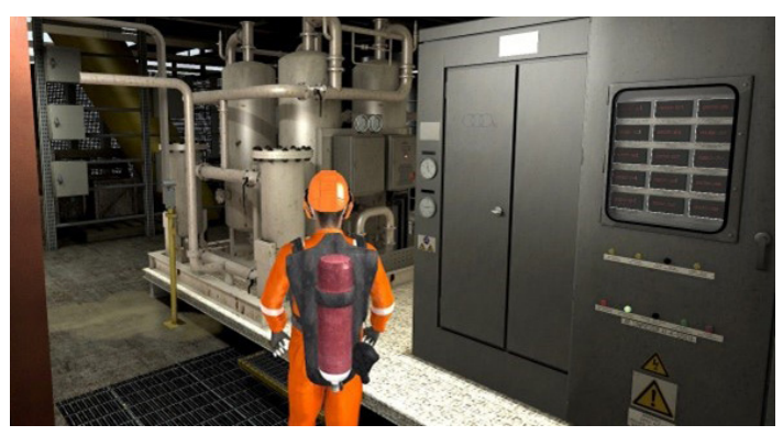
Training for offshore in the onshore VR training room

AVEVA Unified Learning transforms organizational performance and lowers total training costs.