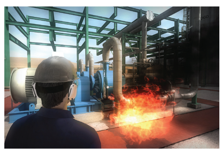
Emergency preparedness training in a VR environment