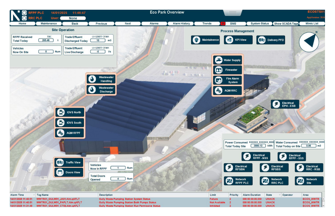
SCADA screens allow the LondonEnergy team to get an overview of systems, with the ability to drill down into particular processes as needed.

This unique combination of BMS and SCADA in one unified operations hub means LondonEnergy can now make faster, more informed decisions across its facilities and reduce operational risks.