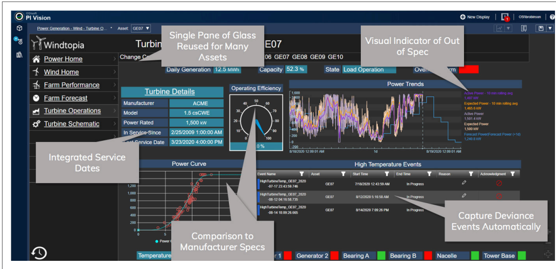
Figure 3. PI Vision display of Wind Turbine operations and asset health.

PI Vision is an intuitive web-based visualization tool that delivers fast, easy, and secure access to all PI System data. Users gain insight into plant operations by creating interactive graphical displays or conducting ad hoc analyses. Users can create displays using either real-time or historical data residing in the PI System.